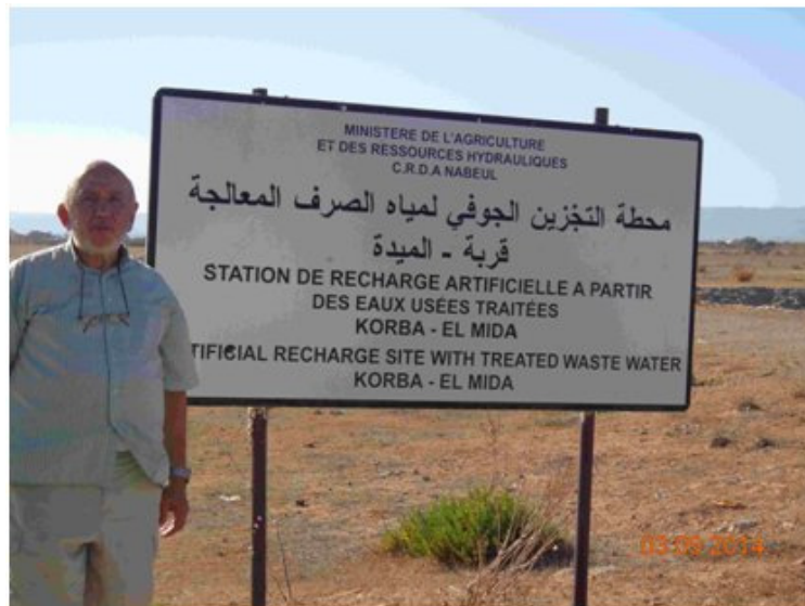
Photo 2: Field trip during the TEMPUS course on "Aquifer Recharge" in Tunisia.

Geographical coverage: N. Africa and SE Europe