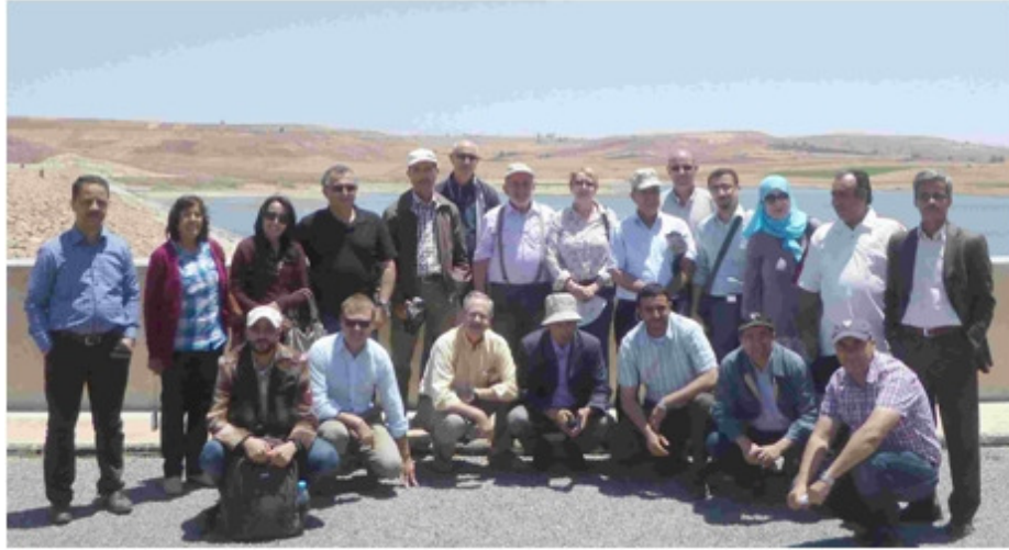
Photo1: Field visit of the Settat dam, Morocco.

A field trip to Berrechid/Bouznika/Benslimane was organised on 27/05: Visit of ABH/ONEP, field measurements, sampling, hydrological gauging, artificial recharge (see photo 1).