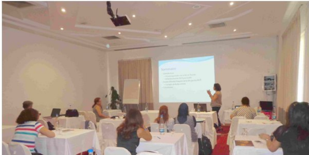
Photo 3: Intensive TEMPUS Course on "Water Governance" in Tunisia.

Geographical coverage: N. Africa and SE Europe