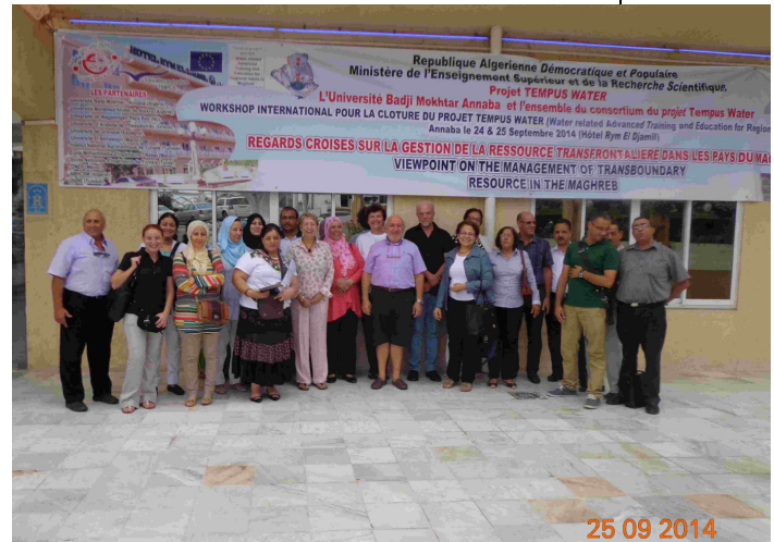
Photos 4, 5: Intensive TEMPUS Course on "Transboundary Waters" in Annaba, Algeria