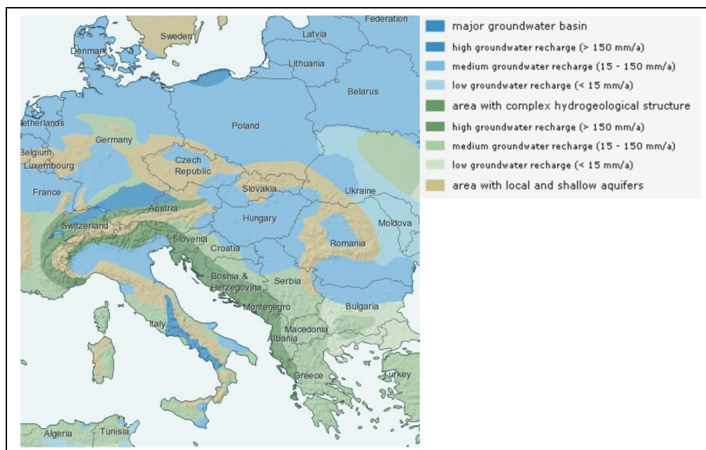
Figure 1: Crop from the World map of groundwater resources (BGR & UNESCO, 2007).

On the international hydrogeological map of Europe (1: 1.500.000) there are shown all larger and important aquifer systems in Slovenia crossing the state border (marked with numbers in circle), groundwater bodies in Slovenia (yellow line) and surface river basin divide between Adriatic sea and Danube river (violet line).